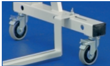
Caster version "R075" with vertically adjustable treadle bar. Casters 360° lockable and thread protected.