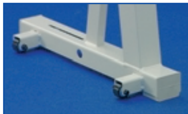
Caster version "ROA", thread protected casters attached to the outside of the right foot.