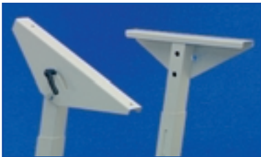
Table top support, tiltable = version "VT".